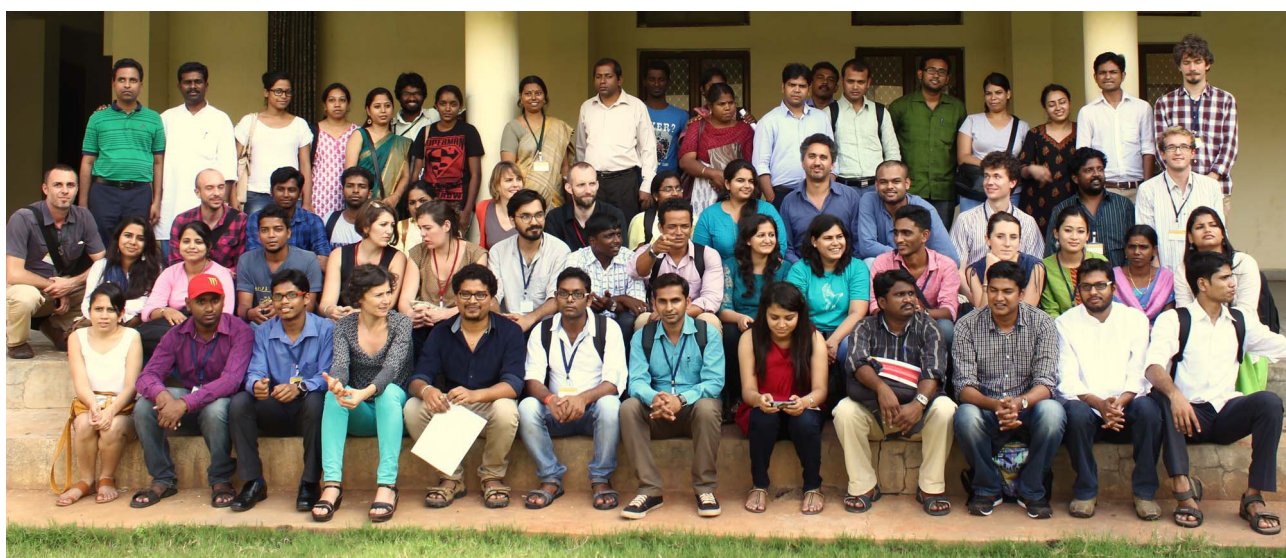
Social Sciences Winter School in Pondicherry