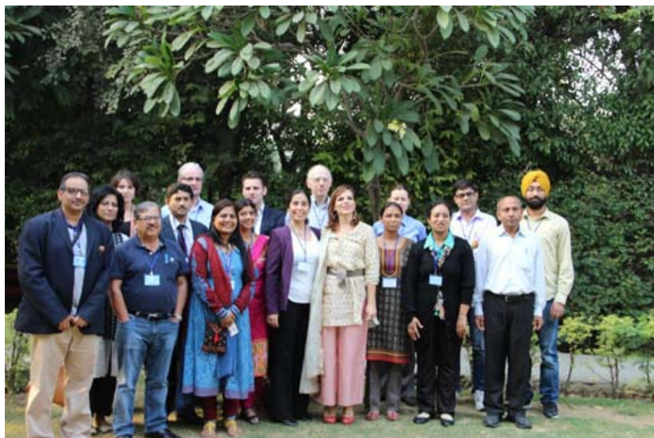
The team of scholars and experts attending the first day of the GIFTA conference in Delhi

agreements (FTAs) and the effects of these FTAs on the EU, USA and Asia, this conference participated to the CSH Trade Investment and Development Initiative (TIDI). In January 2015, the CSH participated to the launching of the GIFTA ("Government and Economic Integration through Free Trade Agreements") at the University of Keele (GB), a project that then set the first stone of this conference, and following the one held in London on European FTAs.