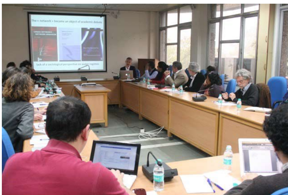
A presentation of the academic papers on the subject of Networks during the conference

This workshop paved the way for new research perspectives. It consolidated