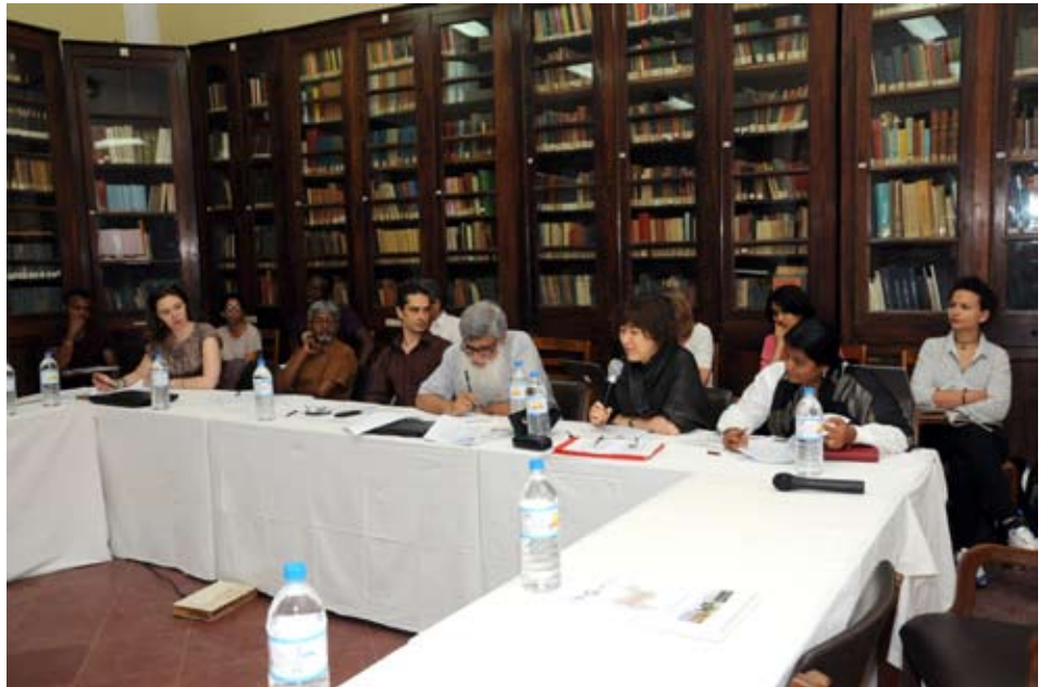
Discussions during the Finurbasie workshop held at the IFP