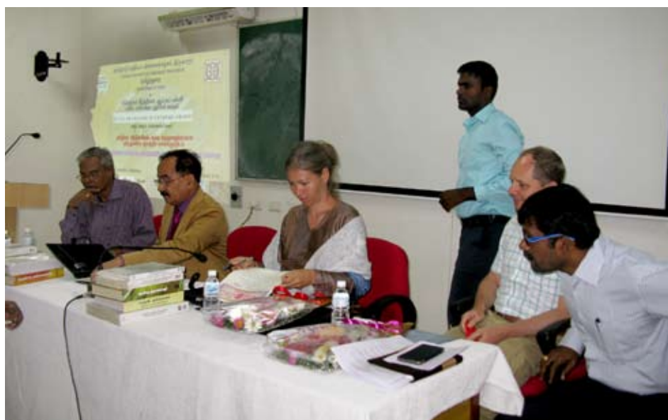
Signing of the MOU between the EFEO and the University of Tamil Nadu, Tiruvarur, Tamilnadu

The EFEO's collection of photographs constitutes an exceptional documentary resource in the domains of archaeology, statuary, architecture, epigraphy and ethnography, covering many Asian