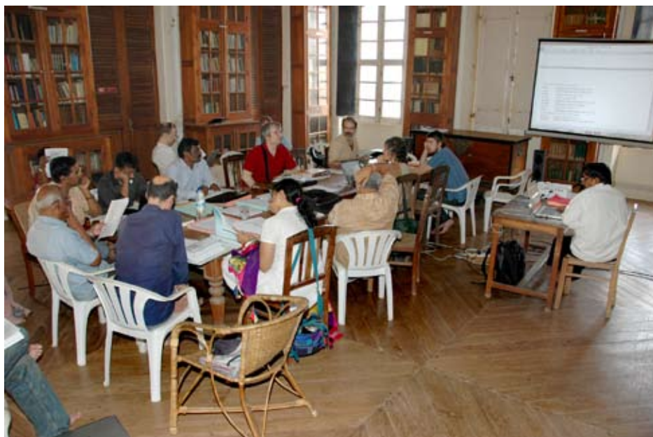
A reading-session during the 13th Classical Tamil Summer Seminar

Please see: http://www.csh-delhi.com/eventdetail/76/spatial-inequalities-of-urban-women-in-accessing-the-city