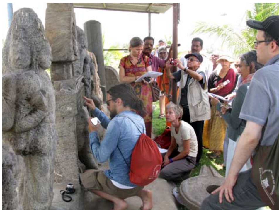
Participants of the workshop “The Archaeology of Bhakti III” during a fieldtrip in Taccur