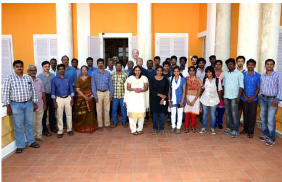
Participants at the National seminar on “Biodiversity Awareness Workshop using Open Source Geospatial Software Tools”

The Western Ghats, a global biodiversity hotspot, is facing a huge crisis due to developmental demands. While this poses a biodiversity management challenge, localised studies and disparate datasets limit the ability to upscale studies/results to a level that can provide actionable inputs to decision makers and planners. New and innovative methods using geospatial technology can help bridge this gap if stakeholders have access not only to the data but also to the appropriate tools for informed decision making. This activity will train participants to equip policy makers and other stakeholders converting