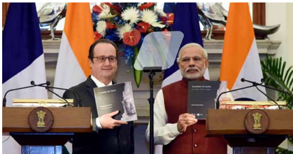
Launching by French President François Hollande and Indian Prime Minister Narendra Modi of the book “Shadows of Gods: an archive and its images” in New Delhi on 25 January 2016

Sripuranthan temple, which found its way to Australia and was returned to India by the Australian Government last year, based on evidence provided by the IFP/EFO Photo Archive.